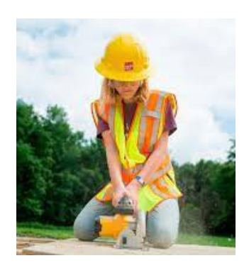
Tools - Hand and Power